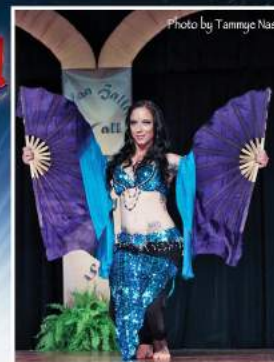
STAR Tribal/Fusion/ Alternative Star Solo Judges' & People's Choice

Deadline for Competition Entries: June 1, 2017