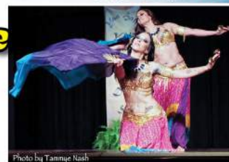
POMEGRANATE VIBRATO Duet/Trio Stars Judges' & People's Choice

RAKS ZAHRAH - Troupe Stars - Judges' & People's Choice