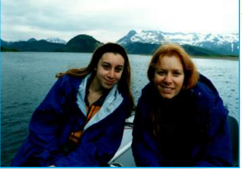
Lynx & Mom in Alaska